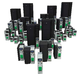
Unidrive M AC/Servo Drives

Please visit our Upgrade Assistance page for product upgrade assistance and contact information.